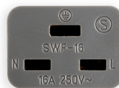
SWF-16 16A C19

Note! The connector must be connected to a wall socket with a ground terminal for the full LoRad effect to take place. Lorad are tested and certified by Intertek Sweden, meeting the European safety regulation HD21.5 S3.