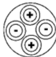
Star Quad connection

The Supra Rondo cable allows for a number of possible connections, where the full range Quad Star, is a nearly ideal laid out suppressing the inductance to low levels. Thanks to its four leads it is possible also to connect as bi-wired or bi-amplified. Tests have shown that full range Star Quad give the best conditions for a better transition of music. The production method we use allow us to twin with short pitch and still keep it resilient, persistent to handling fatigue, making it especially useful on-stage. Further to the Star Quad lead configuration, this short pitch twinning of the leads, contributes to even lower inductance and lowered tendency to pick-up RFI (Radio Frequency Interference, a single denomination of all high frequency electromagnetic fields. Any means to lower RFI in your hifi or multimedia equipment will undoubtedly pay off with lower noise floor and a much crisper and sharper picture as well as a sound full of micro dynamics standing out from a pitch black background, with a completely new level of bass attack and dynamic.