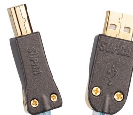
Examples of connectors