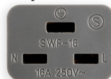
LoRad 2.5 SPC CS-16-BS