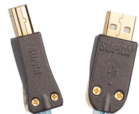
Examples of USB plugs